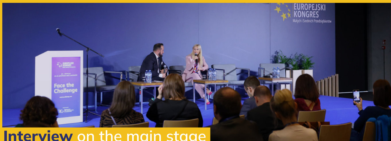
Interview on the main stage