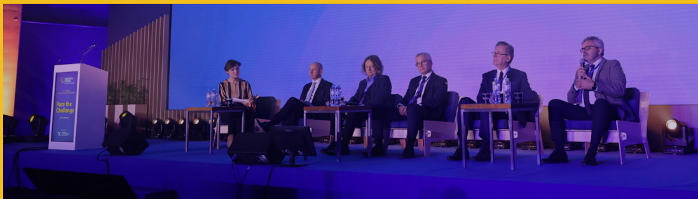
Moderated debate on the main stage