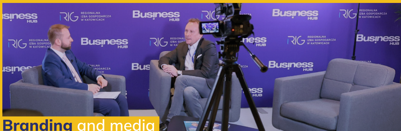
Branding and media