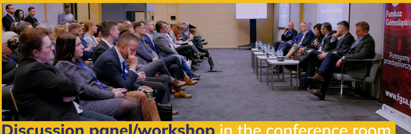
Discussion panel/workshop in the conference room