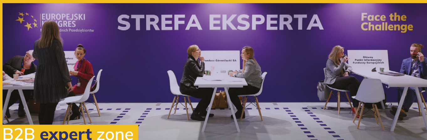
B2B expert zone