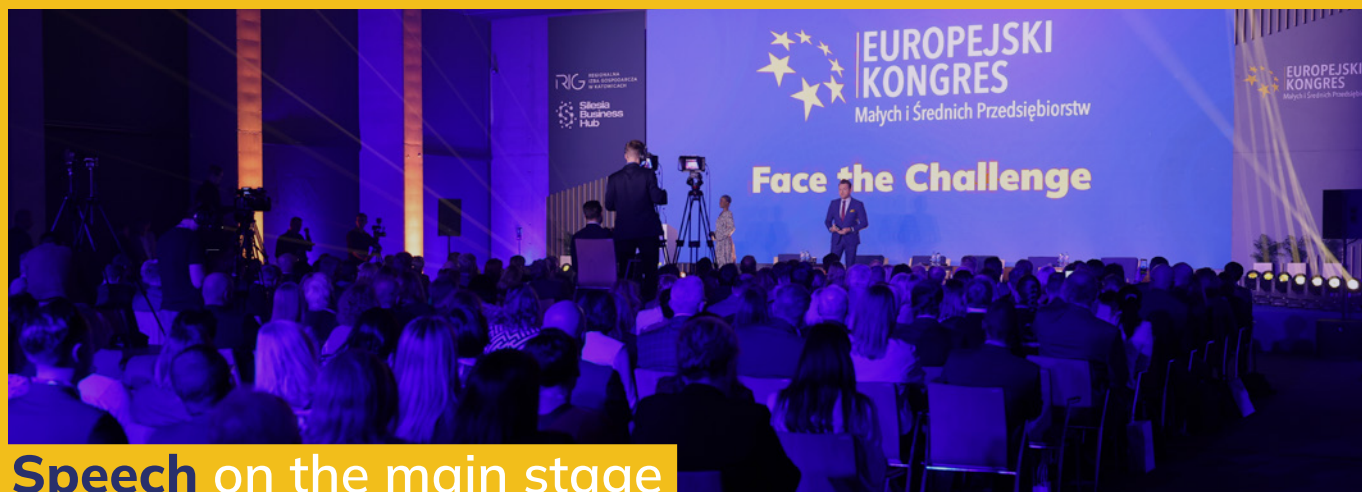
Speech on the main stage